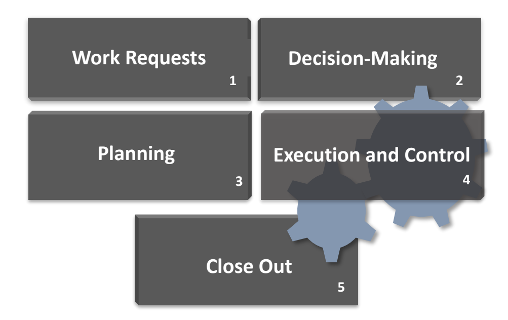
Figure 1. ACSO Project Management Lifecycle