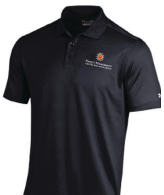
Black Polo Shirt