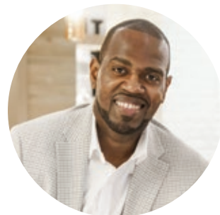
Room Prince George's (1211)